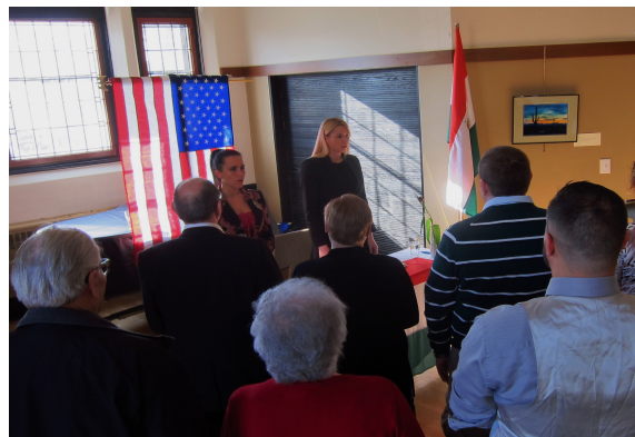
Hungarian Citizenship oath ceremony